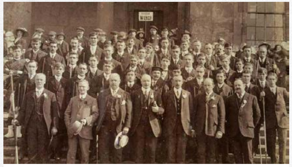
A small group of suffragettes stand conspicuously behind a group of men assembled at the front of Bathgate Academy for a Newlands Day photograph.

The success of the national campaign for female suffrage depended not only upon media stunts and newspaper headlines; they also needed to the win the hearts and minds of the British people. With this goal in mind a committed band of both suffragists and suffragettes toured the country, addressing audiences at town halls and political meetings. The tour brought a number of high profile suffrage campaigners to West Lothian.