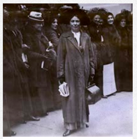
Suffragette leader, Christabel Pankhurst, stands in front of a group of women.

The suffragette's campaign of militancy began in 1905 when Christabel Pankhurst and Annie Kenney attended a meeting in London; it was being addressed by Government minister, Edward Grey. The women kept interrupting with shouts of "Will the Liberal Party government give women the vote?" The police were sent for when they refused to stop their shouts. In the struggle that followed, the two women kicked and spat on the policeman who had been sent to deal with the situation. It had the desired result; they were both arrested, attracting publicity for the suffragette cause.