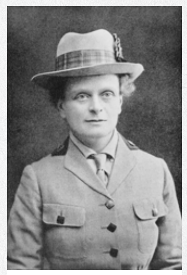
Suffragist Dr Elsie Inglis set up the Scottish Women's Hospital Unit during the First World War.

The women reported that there were almost 500 people in attendance. The hall was packed. There were men sitting on window sills, on the edge of the platform and even on the stairs down to the street. The attendees gueued at the end to buy suffrage badges and copies of the suffragist newspaper, "The Common Cause," although there was not enough to go round. Interestingly there were only 50 women amongst the assembled audience. After the event, the suffragists recalled; "There were men of all kinds and all ages, from the somewhat merry youths and the earnest faced mine-workers, to the oldest men of the village. And what a hearing they gave us...Four very contented Suffragists strolled in the deepening twilight to the country station. Not only had we gained the affections of Mid Calder, we had also received cordial invitations to go and speak at East Calder, West Calder and Oakbank."