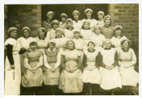
The female employees at the Regent Works were paid much lower wages than male staff. In 1915 they went on strike for better pay.

The outbreak of war in August 1914 brought a temporary end to the female suffrage campaigns. Emmeline Pankhurst suspended the activities of The Women's Social and Political Union, investing her energies in supporting the war effort whilst the government released suffragettes from prison. Other suffrage organisations also put activities on hold although low-profile campaigning continued behind-the-scenes.